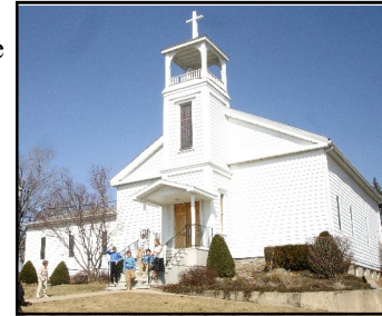
Orwell Bible Church