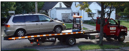
Ok, so our van had a minor glitch—thankfully it was easy to fix. And thank the Lord for AAA!

We have just finished up our travels for the year, and are looking forward to a few weeks of “normal” activity, whatever that is. Here are some of the places we’ve been recently: