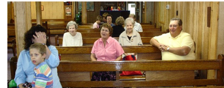
I told you you would end up in our prayer letter...